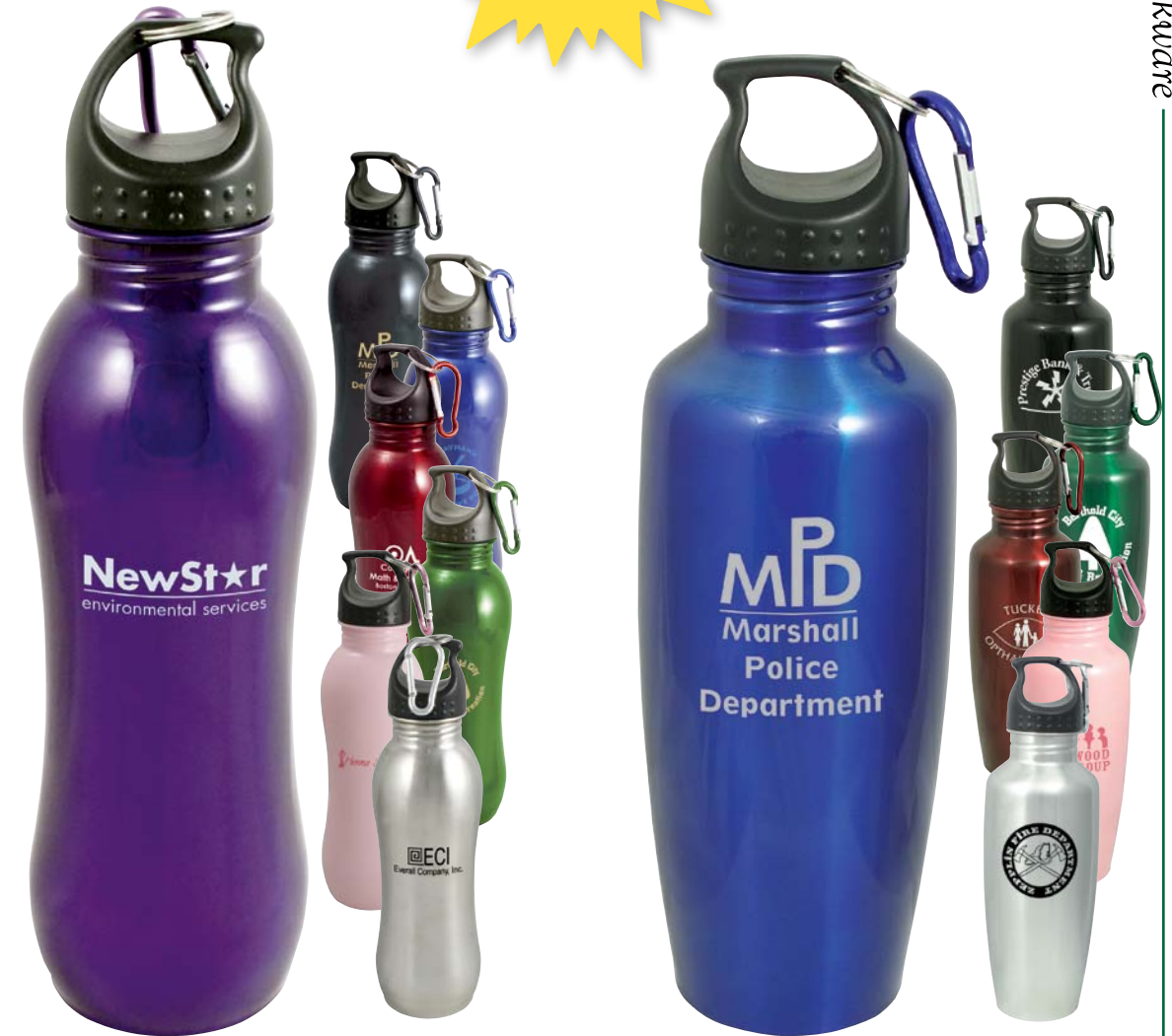
#AFIT Fitness 24 oz. Stainless Water Bottle

Colors Purple, Black, Blue, Burgundy, Green, Pink, Silver