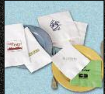
NAPKINS PG 12