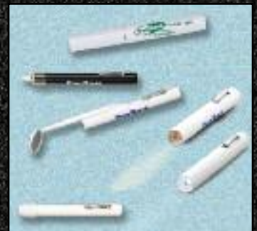
PENLIGHTS PG 39