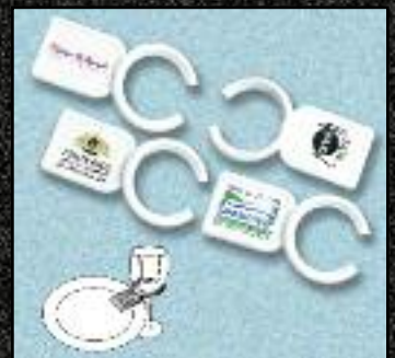
DRINK CLIPS PG 18