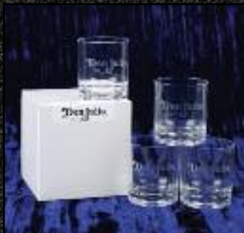
BARWARE GIFT SETS PG 13