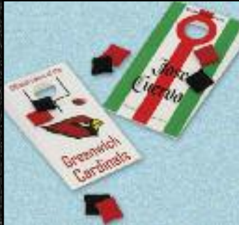
CORN HOLE MINI PG 3