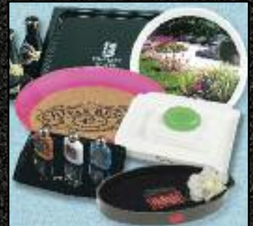
TRAYS PG 28-31