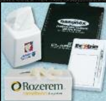
HEALTHCARE PG 36-39