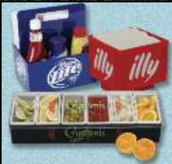
NAPKIN HOLDERS & CONDIMENT TRAYS PG 26-27