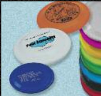
FLYERS PG 35