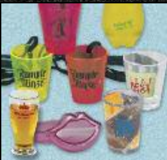
SHOT GLASSES & SAMPLING CUPS PG 14-15