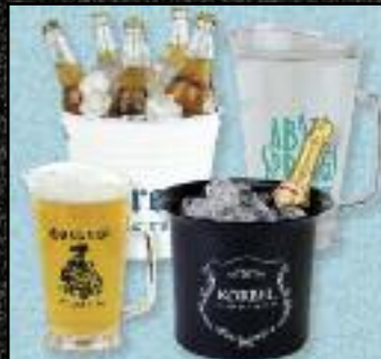
PITCHERS & BUCKETS PG 23