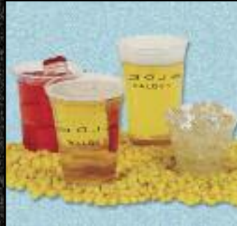
GREENWARE CUPS PG 5