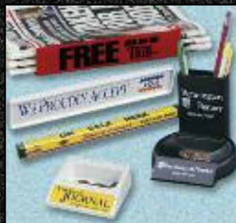
POINT OF PURCHASE PG 32-34