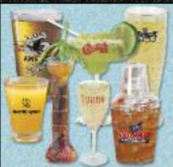
BARWARE PG 16-24