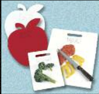
CUTTING BOARDS PG 25