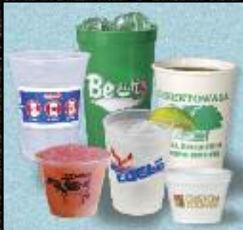
PAPER, PLASTIC & FOAM CUPS PG 4-11