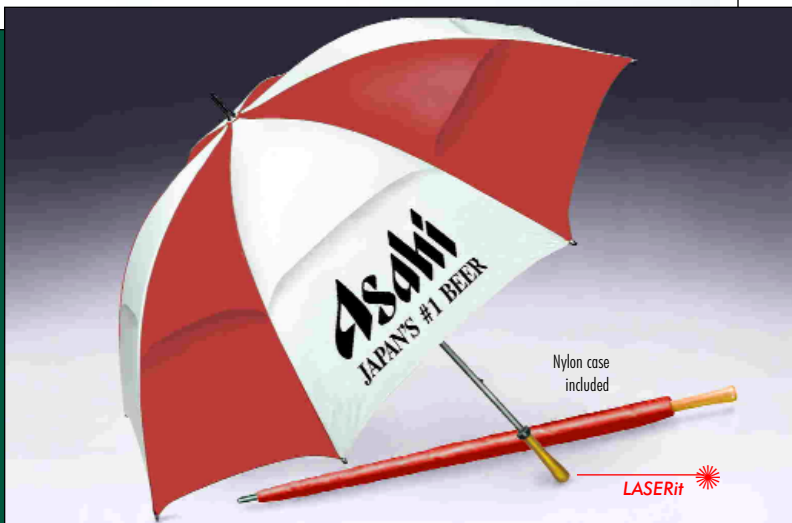
Nylon case included