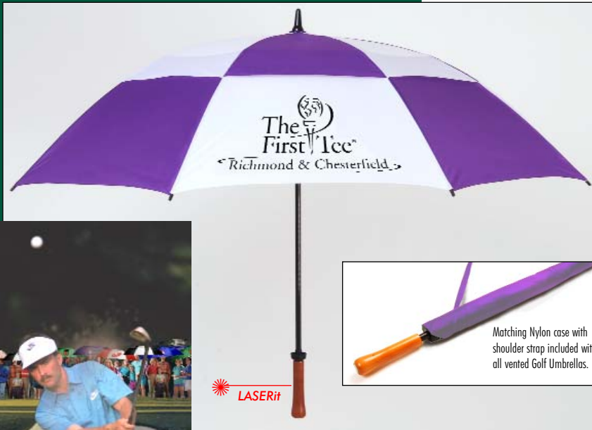
Matching Nylon case with shoulder strap included with all vented Golf Umbrellas.