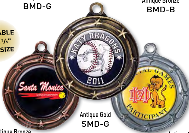
Antique Bronze SMD-B