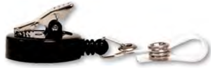
BRR-SW2 Swivel Bulldog Clip showing side view with clip