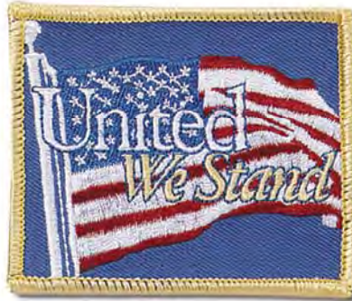
75% EMBROIDERY COVERAGE