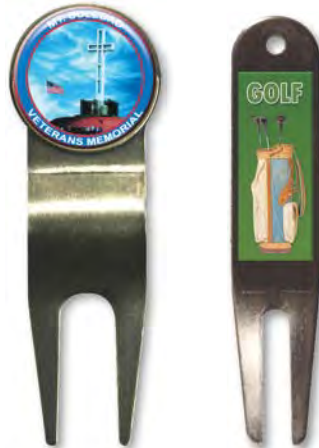
Econo Repair Tool w/ Ball Marker ERT-BM