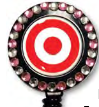
BRS Badge Reel w/Stones