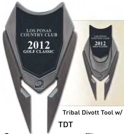
Tribal Divott Tool w/ Ball Marker TDT