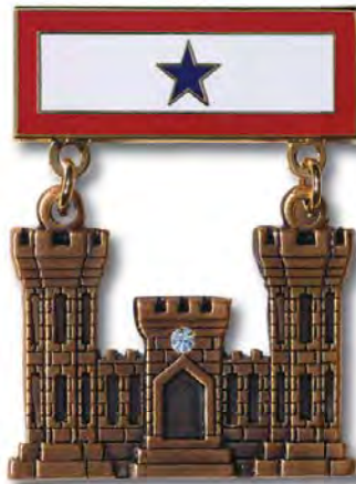
Two-Part Pin Top: Cloisonné, Bottom: Casted