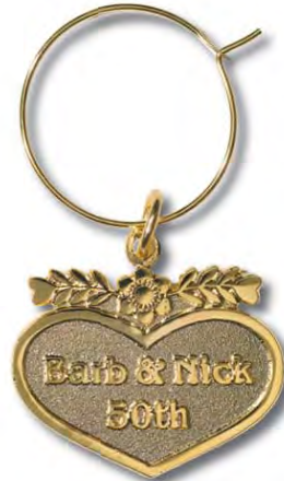
Wine Charm Attachment (See page 14)