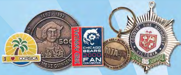
TABLE OF CONTENTS TRADITIONAL PRODUCTS