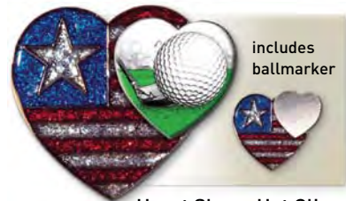
Heart Shape Hat Clip w/ Ball Marker