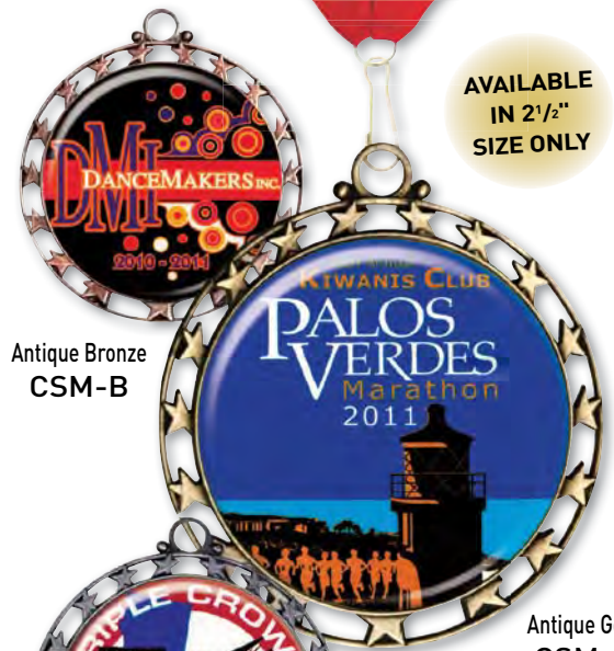
Antique Bronze CSM-B