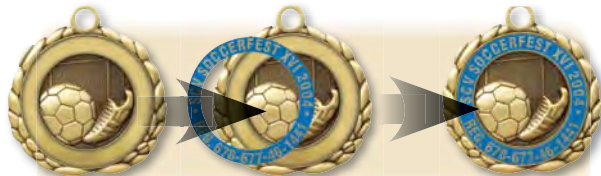
STOCK MED-28 SHOWN WITH CUSTOM MYLAR RING - PRICING ON PAGE 28

STOCK "MED" MEDALLIONS WITH STOCK "MR" MYLAR RINGS- PRICING ON PAGE 28