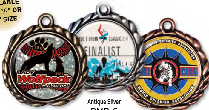
Antique Gold BMD-G