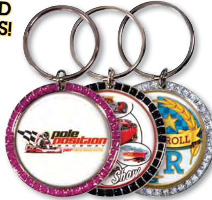
KTC-J (Pink, Black, Clear)

OTHER INFORMATION: KTB-1, KTB-2, KTDJ and KTC-J are available in a silver finish. The KTR, KTSQ and KTO series are available in a bright gold finish. All keytags come with a split metal ring, individually polybagged and include a free setup. FOB NC or CA.