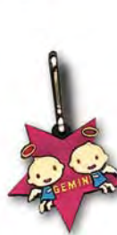
PVC ZIPPER PULLS