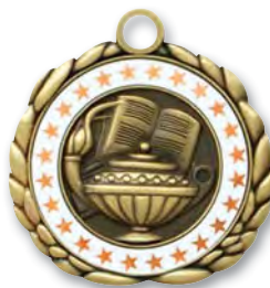
Book & Lamp MED-08