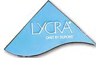
Shown with Screen Print