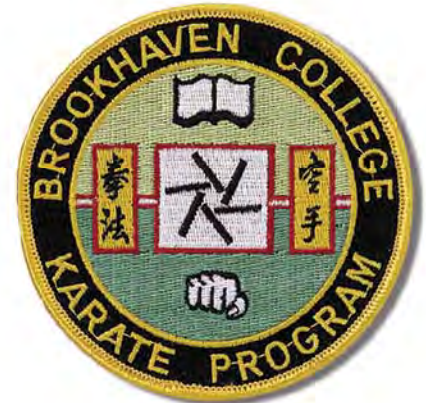
100% EMBROIDERY COVERAGE