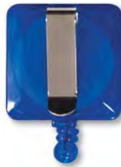
Slide Belt Clip