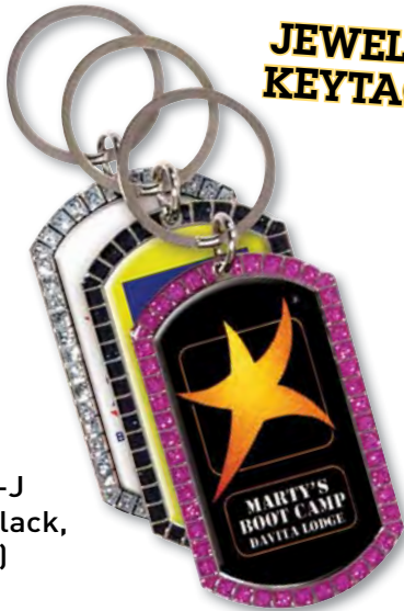
KTDJ (Clear, Black, Pink)