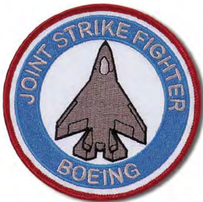
Merrowed (Included n/c)