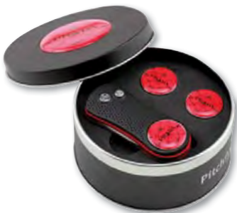
PFX-GS Deluxe gift set with custom logo on lid & two extra ball markers