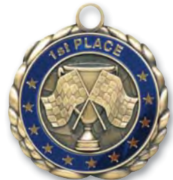
Crossed Flag MED-11