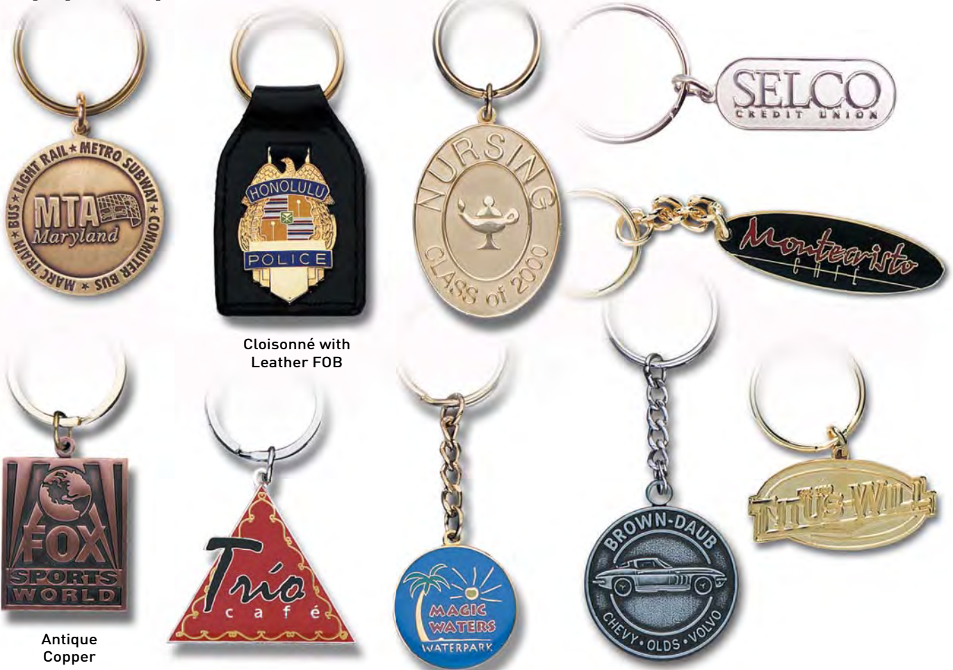
Cloisonné with Leather FOB

Each metal is die-struck copper or brass and plated in gold, silver, bronze, nickel or black nickel for more strength and durability in a 2-dimensional appearance. Hand finished and elegant, these can be produced with up to four enamel PMS® colors or without any color. A split metal key ring, and loop are standard. An epoxy dome is optional.