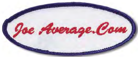
50% EMBROIDERY COVERAGE

We can produce all standard and custom shapes and sizes. Whether you provide new designs or require duplication of an existing patch, embroidered emblems make it a natural for fund raising, achievement awards and souvenir sales for schools, groups or organizations. Each emblem is made of a washable twill or felt background and includes up to seven colorfast threads (additional colors can be added). Hundreds of thread colors are available as well as metallic gold and silver threading. Add thermoplastic or heat seal backing to reduce shrinkage and increase the emblems durability. Reflective twill, Velcro® and adhesive backings are some creative options.