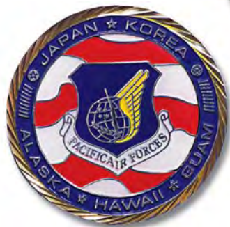
Diamond Cut Edge

Each medallion is die-struck metal and plated in gold, silver, bronze, nickel or black nickel. Sandblasting and brushing provide contrast with the highly polished raised areas. Hand finished and elegant, these can be produced with or without colorfill.