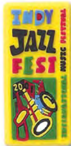
PVC LAPEL PINS