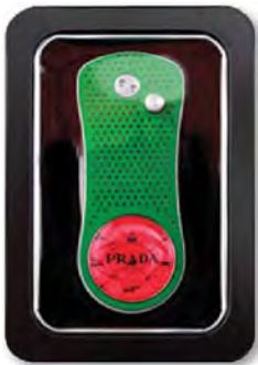
PFX-WB Gift Set with window cover