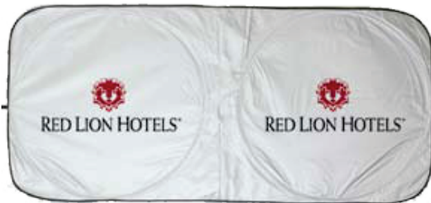
AD-FDC - Nylon Single Panel Dual Circle 58" x 27" Imprint Area - 14"w x 14"h each circle 100 per Case (40 lbs)