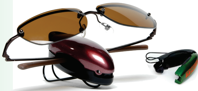
AD-VC - Sunglass Visor Clip (1 color imprint only) Imprint Area - 1.5"w x .625"h (300 per Case/20 lbs)

Did you know Adsun also Carries Sunglasses and Key chains? Please visit www.adsuninc.com and click on the tab marked "Best Selling Bargains"