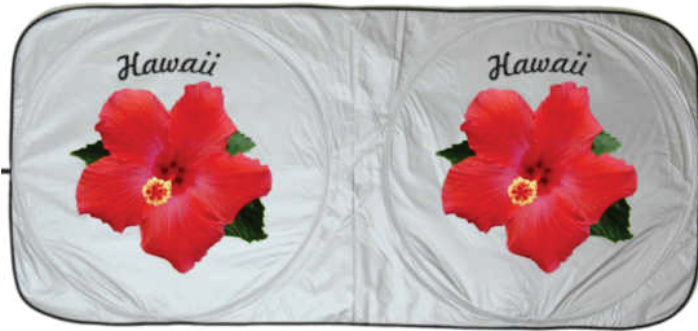
AD-FDCSUV-Nylon Single Panel Dual Circle 63" x 29" Imprint Area - 16"w x 16"h each circle (100 per Case/40 lbs)

All Sunshades on this page are Collapsible. They twist into a Compact Disc and are held together with a sewn in elastic strap for easy backseat storage. See General Information on page 31 for Set up Charges and addition Imprint Color Options