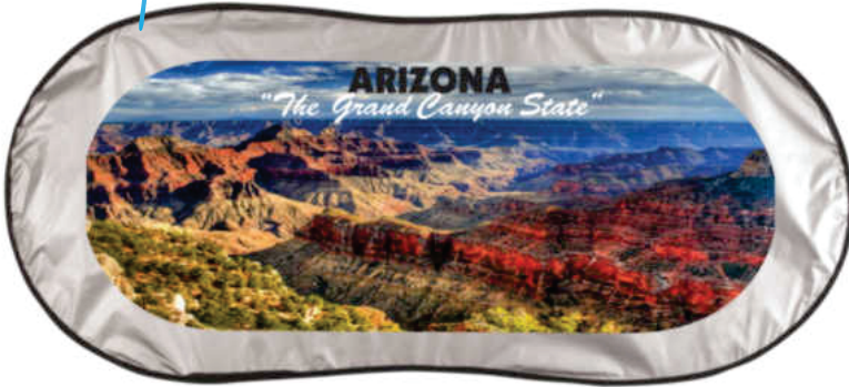
AD-F1SUV - Nylon Single Panel 54" x 30" Imprint Area - 40"w x 16"h (100 per Case/40 lbs)

4 Color Process Art can be printed on All Nylon Shades. The imprint area is 3" to 4" from the border of the shade. See 4CP column for pricing below and General Information page 31 for Set Up charges and additional details.