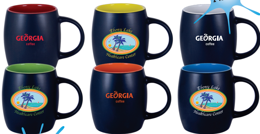
WP1881 - 14oz. Robusto Mug w/Matte Finish Imprint Area - 2.5" w x 1.75" h 36 per Case (50 lbs)