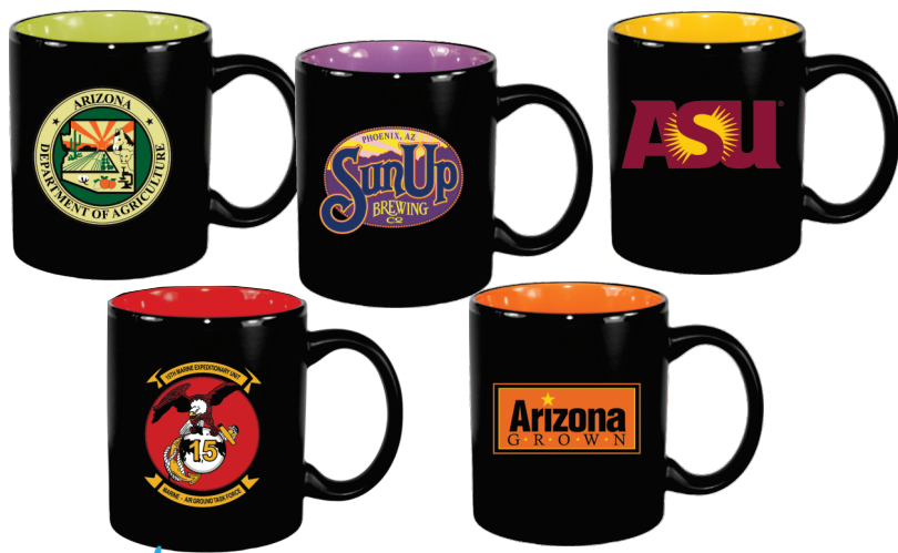
7168H - 11oz. Hilo Mug with Matte Finish Imprint Area - 3" w x 2.75" h (7.75" wrap) 36 per Case (50 lbs)