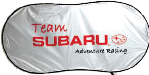
AD-F1 - Nylon Single Panel 52" x 24" Imprint Area - 38"w x 12"h (100 per Case/40 lbs)