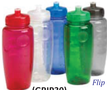
(GRIP30) MADE IN USA