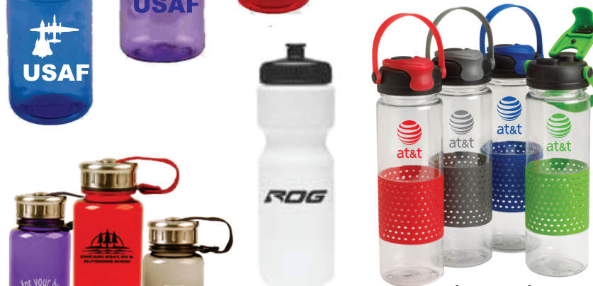
(BIKE28) Made in USA