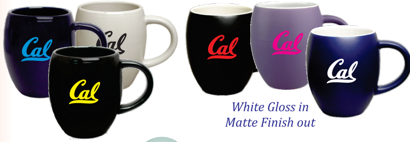
White Gloss in Matte Finish out

Pricing Includes One Color - 1 Side, 2 Sides or Wrap Imprint