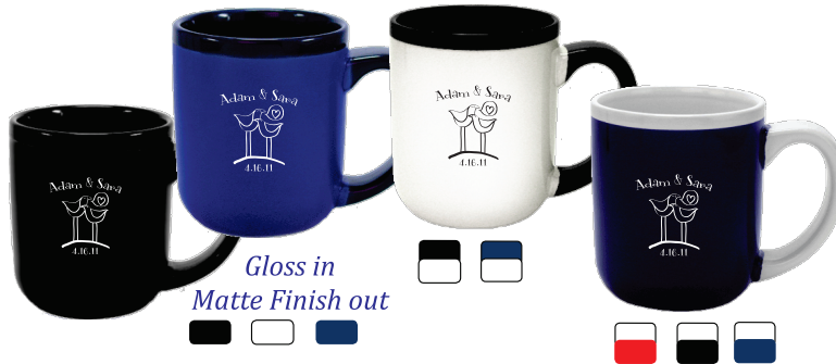
Gloss in Matte Finish out