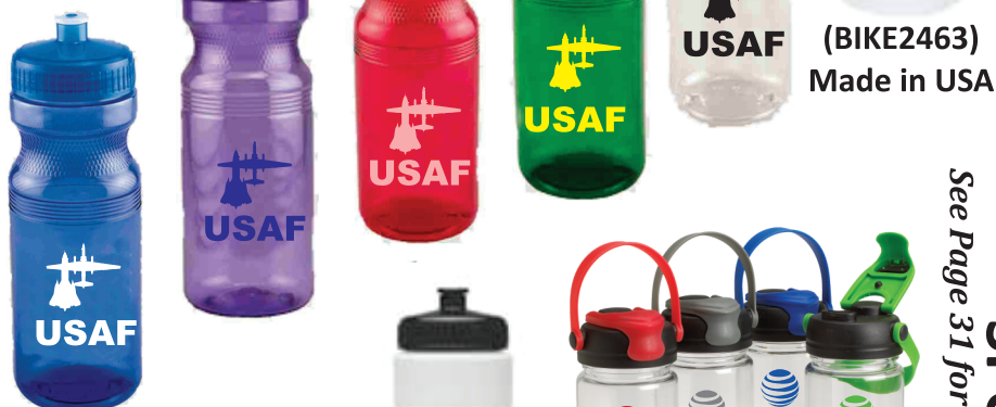
(BIKE2463) Made in USA

BIKE28 - 28oz. Bike Polyclean Sports Bottle Imprint Area: 2.75" w x 4.25" h (100/55 lbs.)