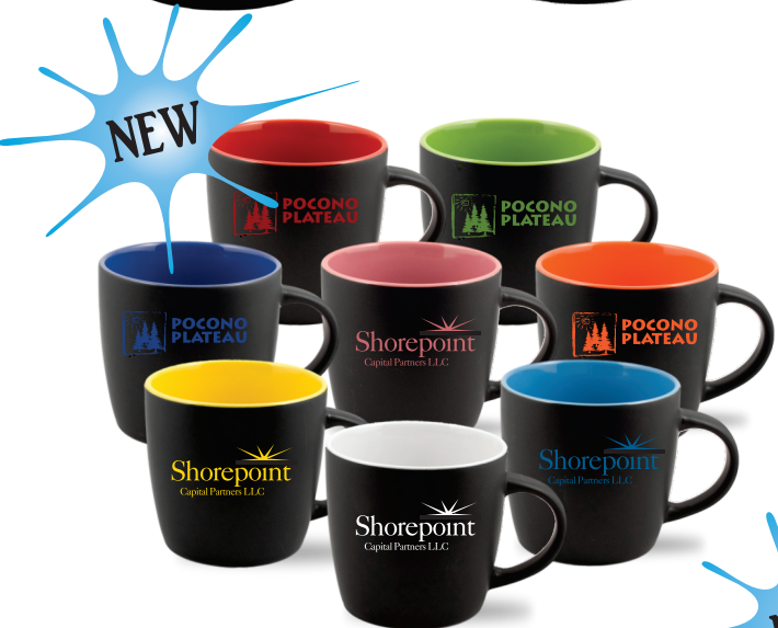
WP1859S - 12oz. Café Mug w/Matte Finish Imprint Area - 3" w x 1.5" h 36 per Case (50 lbs)

Multicolor Imprints are not a Problem! Waterslide Decals Available. Call Factory for Details