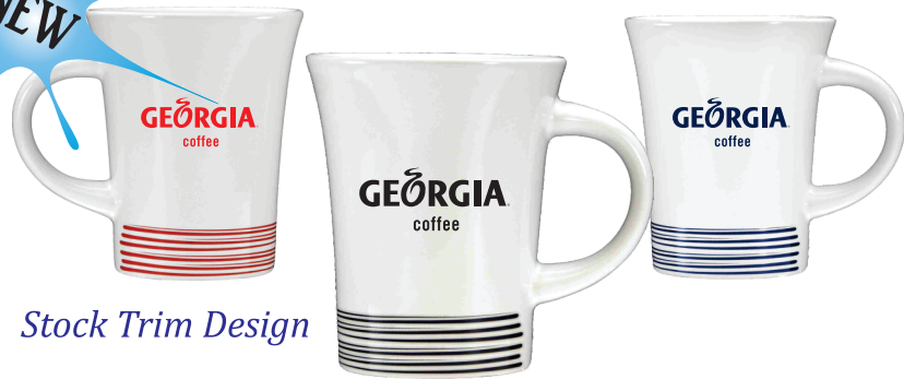
Stock Trim Design

CS39 - 12oz. Savannah Speckled Funnel Latte Imprint Area - 2.5" w x 2.25" h (7.75" wrap) 36 per Case (50 lbs)