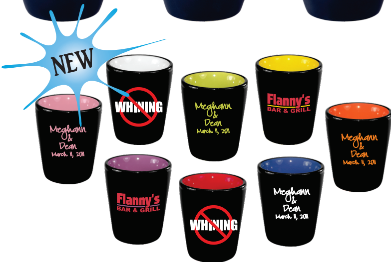
1122H - 1.5oz. Hilo Shot Glass Matte Finish Imprint Area - 2.25" w x 1.5" h 72 per Case (17 lbs)

Lighter ink colors that are baked on to Black Matte Finish mugs can take on a darker, Gray tone when fired. Our Air-Dry Epoxy Organic inks are available in a wide variety of vibrant colors and can eliminate the graying issue at no additional costs. Consult factory for information on these imprint ink options.