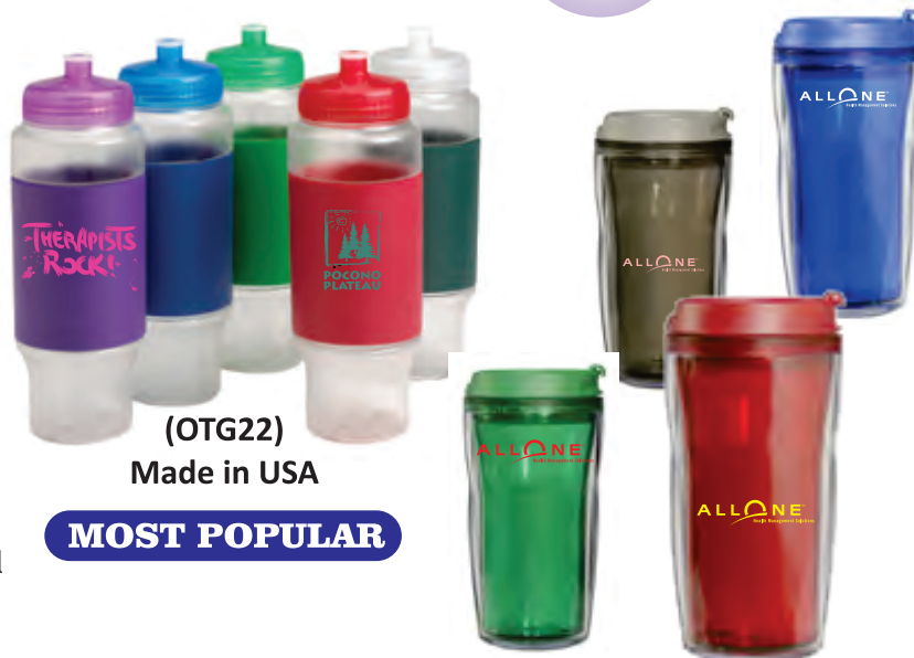
(OTG22) Made in USA

Prices are subject to change without notice. Always call for current pricing.