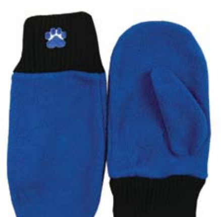
Mitts-400 1" x 1" appliqué