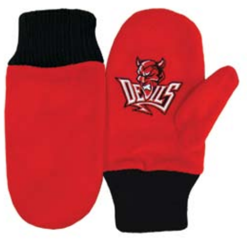
Mascot Mitten 2" x 2 1/4" appliqué