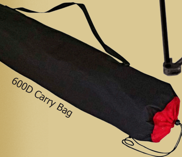
600D Carry Bag