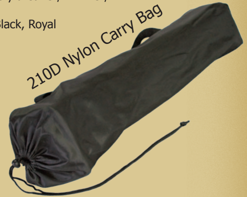
210D Nylon Carry Bag