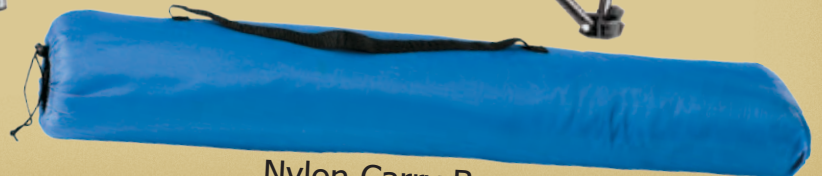
Nylon Carry Bag