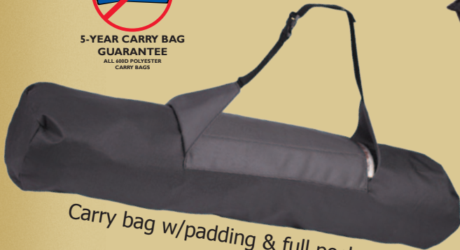
Carry bag w/padding & full pocket

5-YEAR CARRY BAG GUARANTEE ALL 600D POLYESTER CARRY BAGS