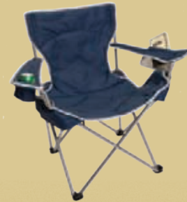
Navy / Silver Trim