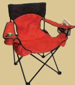
Red / Black Trim

Colors: Black/Silver Trim, Royal/Black Trim, Red/Black Trim, Navy/Silver Trim