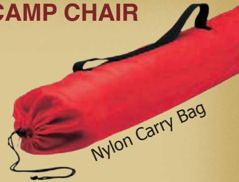
Nylon Carry Bag

Imprint area: 11"W x 4"H (2-color MAX) Embroidery area: 6"W x 4"H