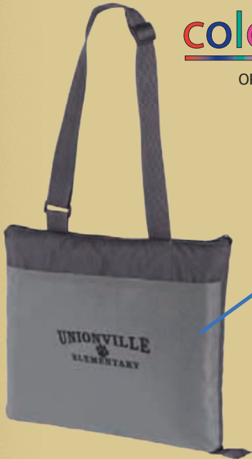
Blanket folds into its built-in zippered pouch. Pouch doubles as stadium cushion.