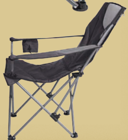
Three position recline