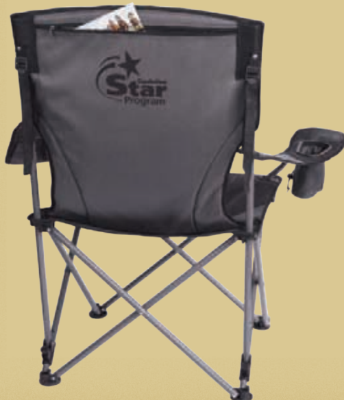
Large full length back pocket