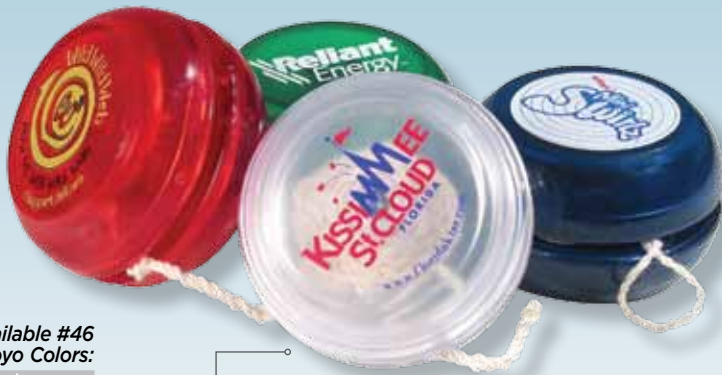
Available #46 Jewel Yoyo Colors: