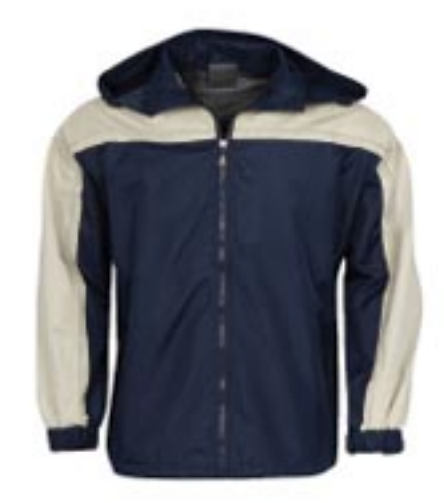
Navy / Khaki