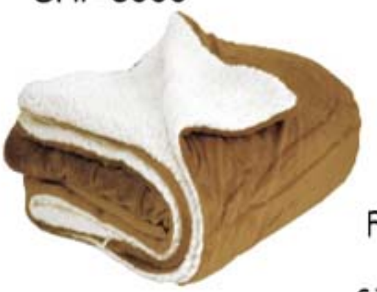
Includes CAMEL Viny Carry Bag