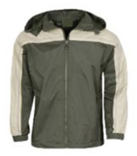
Olive / Khaki