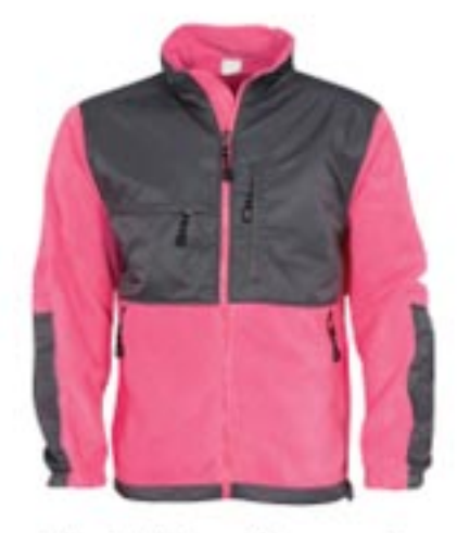
Hot-Pink - Charcoal