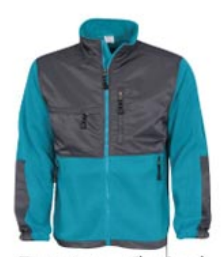
Turquiose - Charcoal