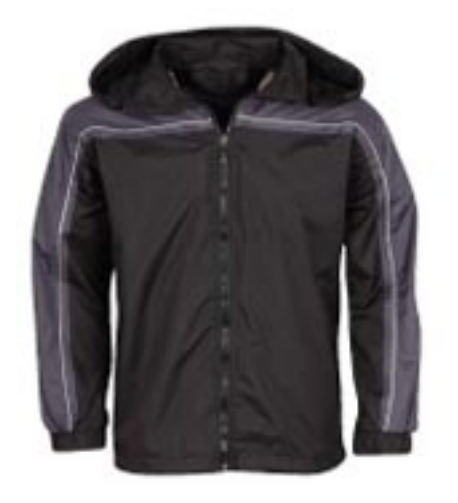
Black / Charcoal