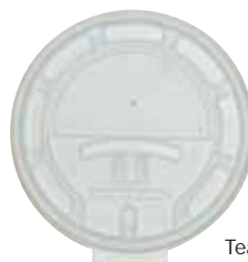
Tear Back Lid