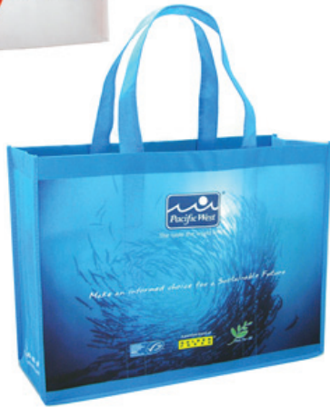
C. 18" non-woven pp handles