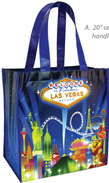
A. 20" self-material handles & piping