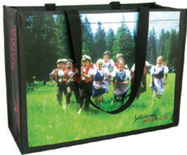
B. 22" webbing handles