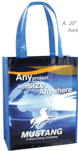
A. 20" self-material handles & piping