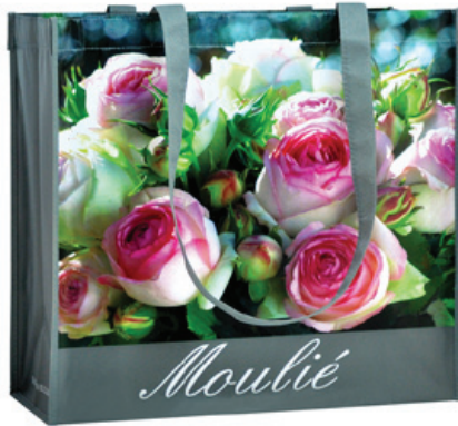
B. 24" non-woven pp handles