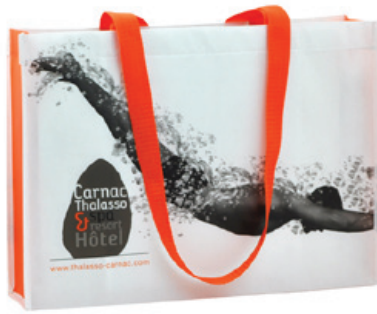
A. 24" webbing handles