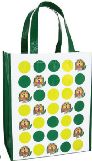
B. 18" self-material handles & piping