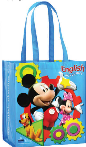
B. 20" non-woven pp handles & piping