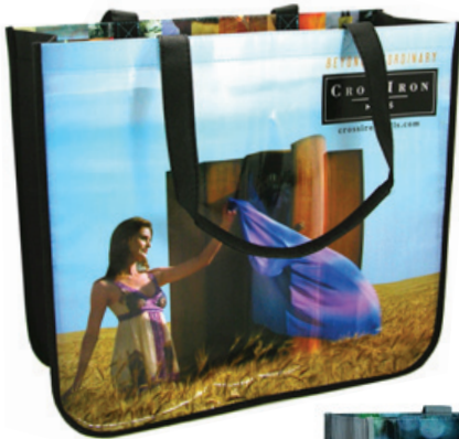
A. 20" non-woven pp handles & rounded corners