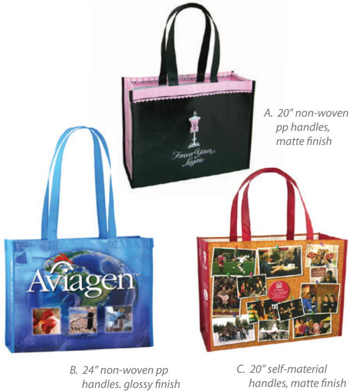
A. 20" non-woven pp handles, matte finish