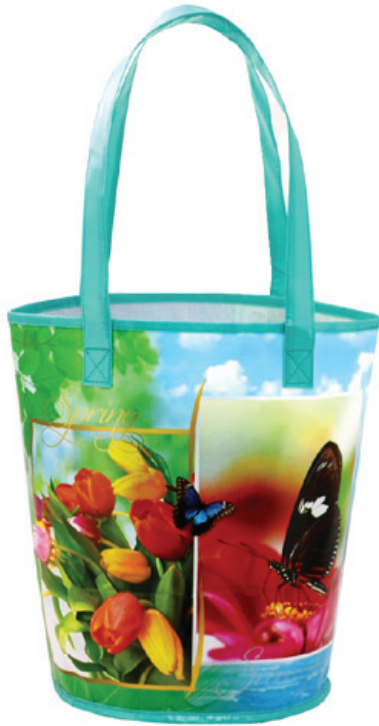
bucket-style bag with round bottom & no gussets