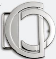
die cast buckle bright nickel finish