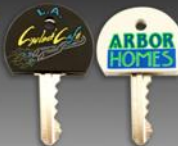
key covers without LED