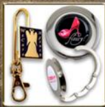
Bag & Key Holders