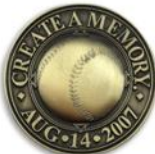
3 dimensional design antique brass finish