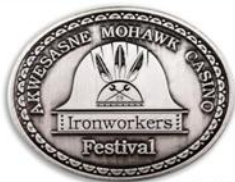
antique silver finish