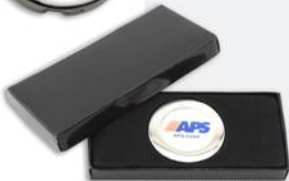
Deluxe presentation box at no extra charge.

Folding Bag Hanger with upgraded magnetized clasp and NEW hidden hook! Unique and practical...the perfect gift or giveaway item. Bags are suspended clear of the floor in restaurants, offices or restrooms, keeping them clean and safe. Folds completely for compact storage when not in use. Includes a 1-1/4" custom emblem with full color digital imprint & epoxy dome. Bright silver finish. Deluxe gift box packaging included. Production time: 2 weeks. Rush service available.