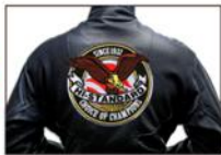
Extra-large patches QUR