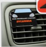
auto air freshener