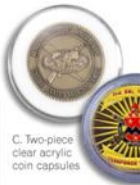
C. Two-piece clear acrylic coin capsules