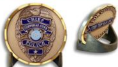
E. Die cast brass desktop coin stand