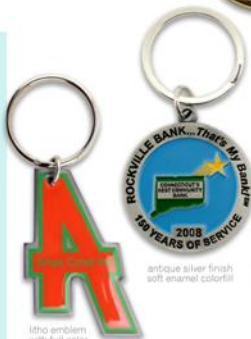
litho emblem with full color imprint and epoxy dome : QUR