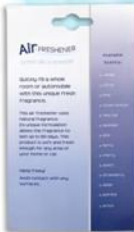
Stock packaging front and back

Two-sided, full color imprint on high quality, scented card stock.