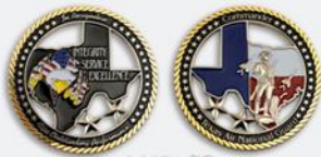
dual plating - QUR design piercings: no extra charge

Please call for details on larger size emblems.