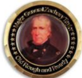
litho center w/epoxy dome - QUR diamond cut edge (die struck only)