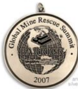
antique silver finish