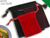
E. Velour drawstring presentation pouches