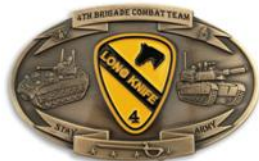
antique brass finish soft enamel colorfill