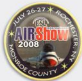
full color printed medallion