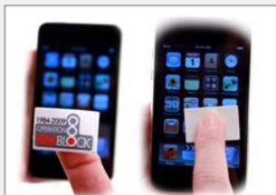
Microfiber cloth clings to surface, simply peel off, place sticky side on finger and wipe!

Setup charge 40.00 ABSOLUTE MINIMUM: 600 pcs.