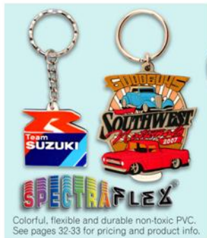
Colorful, flexible and durable non-toxic PVC. See pages 32-33 for pricing and product info.