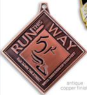
antique copper finish