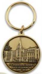
3-D design antique brass finish