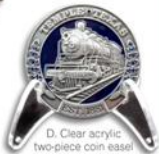
D. Clear acrylic two-piece coin easel