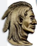
3-dimensional design antique brass finish