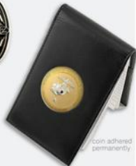
coin adhered permanently