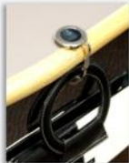
Securely suspends bag from any level surface.

Fast Two Week Production On All Bag Hangers!