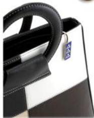
Attractive and useful... hooks over the edge of most bags for fast and easy key access.