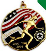
3-dimensional design bright gold finish