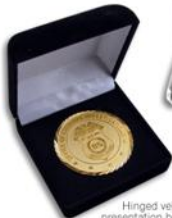
Hinged velvet presentation box QUR