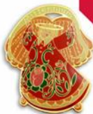
piercing in design