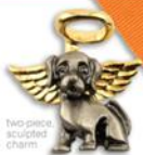
two-piece sculpted charm