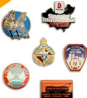
black nickel plating