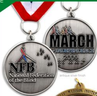
antique silver finish