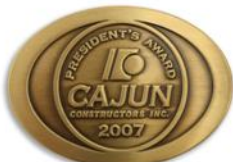
antique brass finish