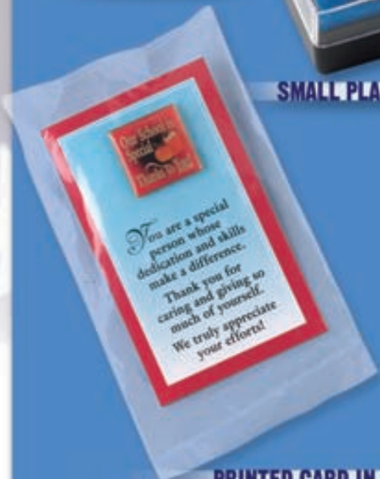
PRINTED CARD IN POLY BAG