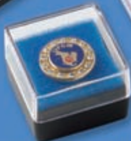
SMALL PLASTIC BOX