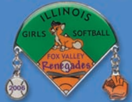
Multiple Hanging Pins