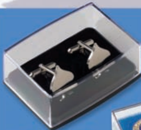
CUFF LINK BOX