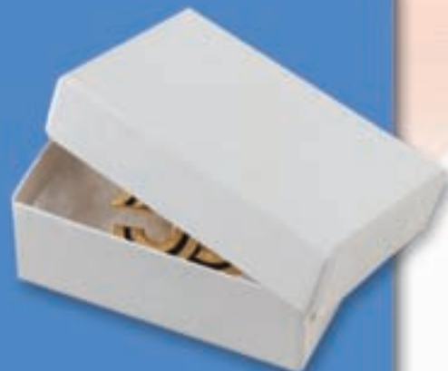
WHITE COTTON GIFT BOX