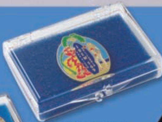
LARGE PLASTIC BOX