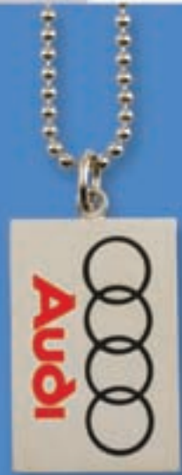
Car Mirror Charm