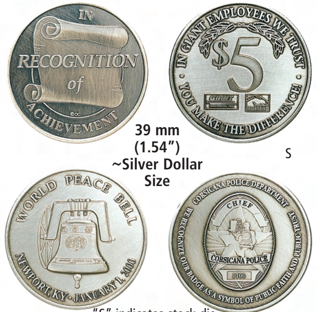
39 mm (1.54") ~Silver Dollar Size

LEAD TIME: 4 weeks from receipt of camera-ready artwork.