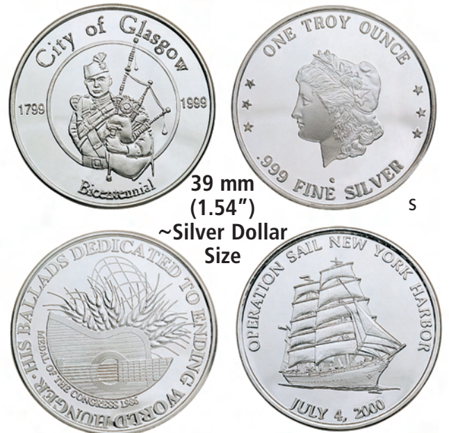
“S” indicates stock die

YOU MUST ADD THE COST OF 1 OZ. FINE SILVER TO THE COST OF MINTING THE COIN (SHOWN BELOW). SPOT PRICE CHANGES DAILY. CALL SALES FOR SPOT PRICE OF SILVER. PAYMENT FOR SILVER MUST BE MADE WITHIN 24 HOURS.