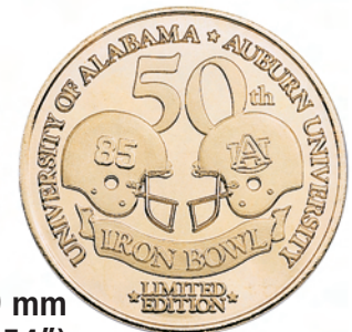
39 mm (1.54") ~Silver Dollar Size