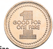
1" ~Quarter Size