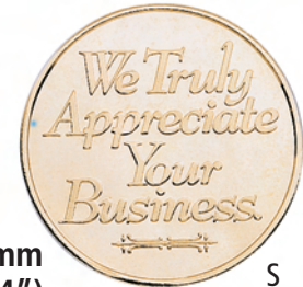
34 mm (1.34")