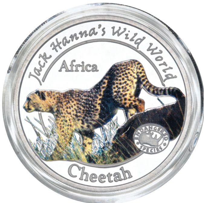
Enlarged to show detail.