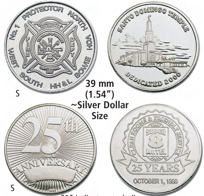
39 mm (1.54") ~Silver Dollar Size

LEAD TIME: 2 weeks from receipt of camera-ready artwork.