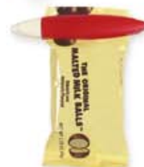
Blade For Easy Opening Of Bags