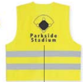
Optional Imprint Back