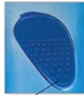
Non-Slip Rubber Side Grip

PACKAGING: Poly Bag, 48 per carton @ 14 lbs.