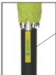
Optional Printing On Plate