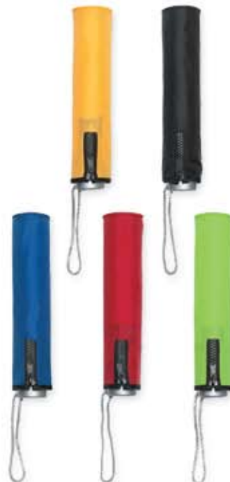
9 1/2" Folded