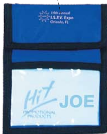
Optional Imprint Area