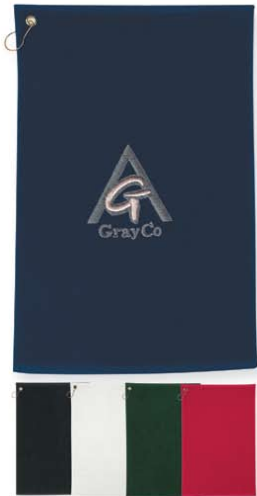
#6074 Unfolded With Grommet And A Hook