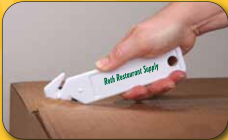
DL908 - Bag 'n Carton Cutter