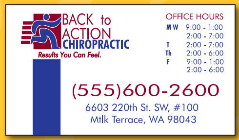
19506 - Pick™ Business Cards