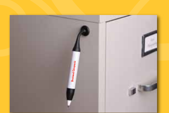
DLM5000 - Magnetic Handy Hanging Pen