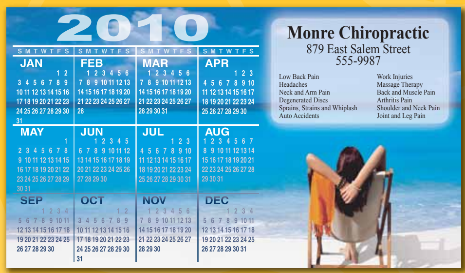
21028 - Process Color Calendars - 20 mil.