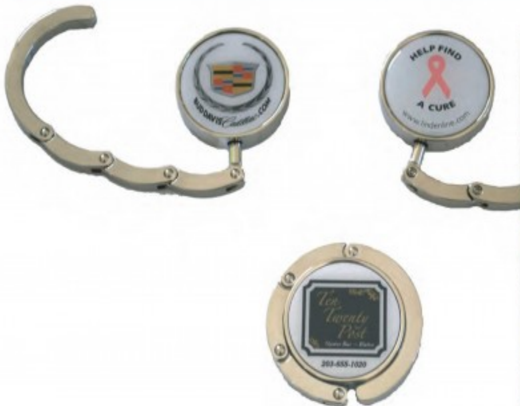
Photo Vision Purse Holder