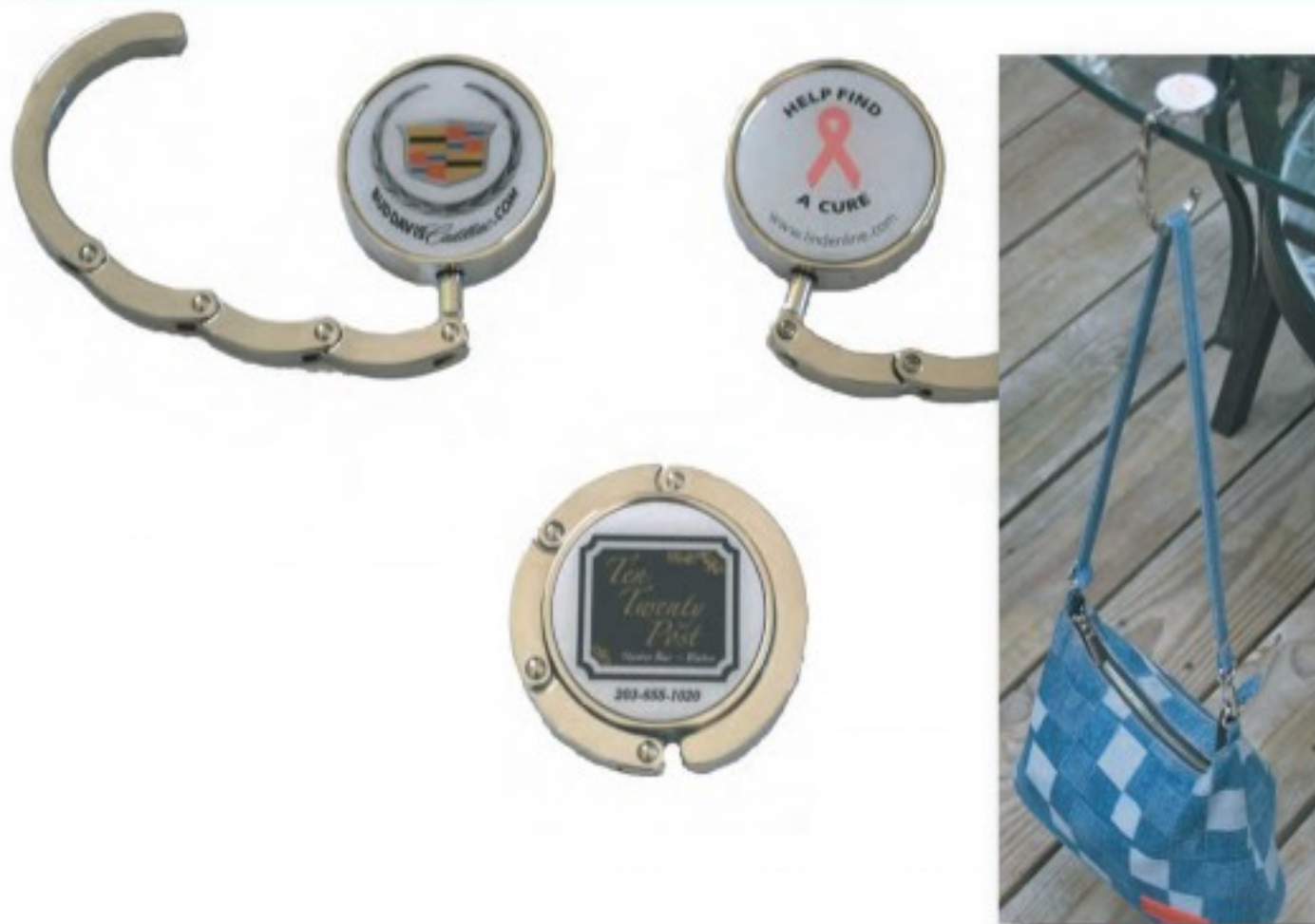
Photo Vision Purse Holder