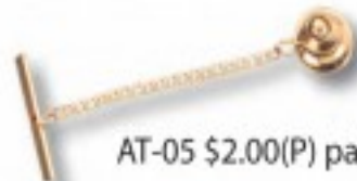
AT-05 $2.00(P) pair