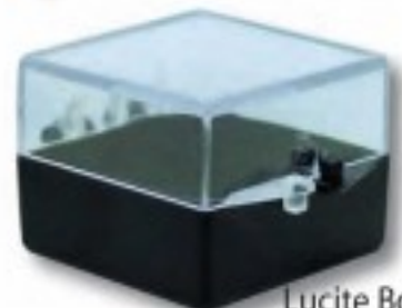
Lucite Box $.70(P)