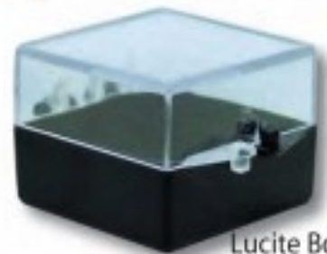
Lucite Box $.70(P)