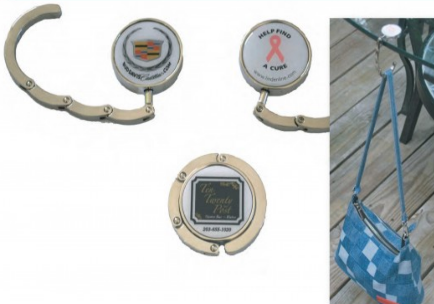
Photo Vision Purse Holder