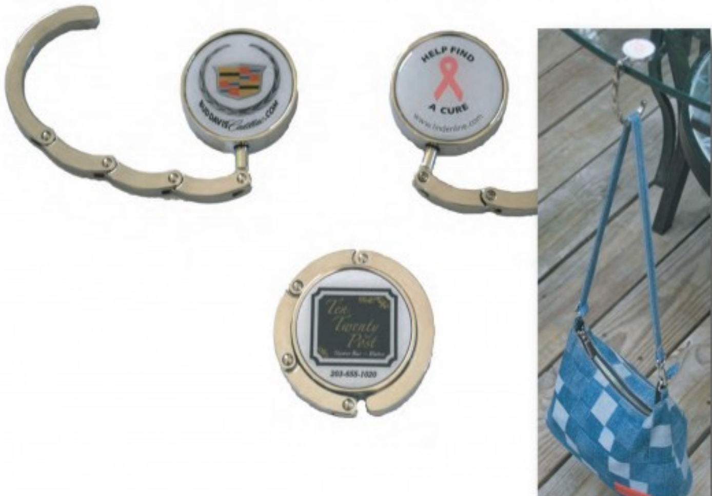
Photo Vision Purse Holder