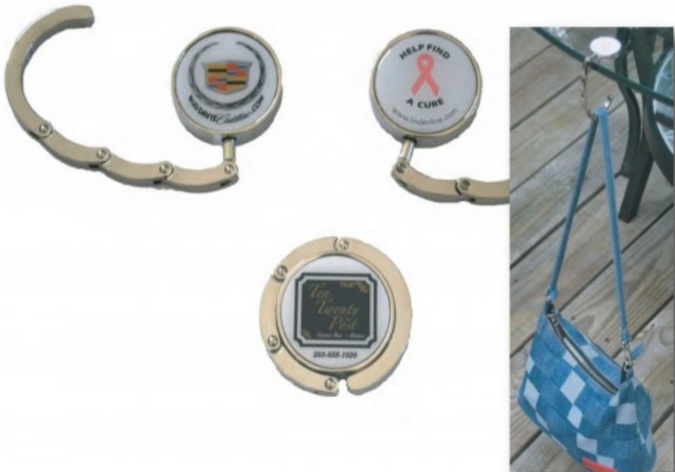
Photo Vision Purse Holder