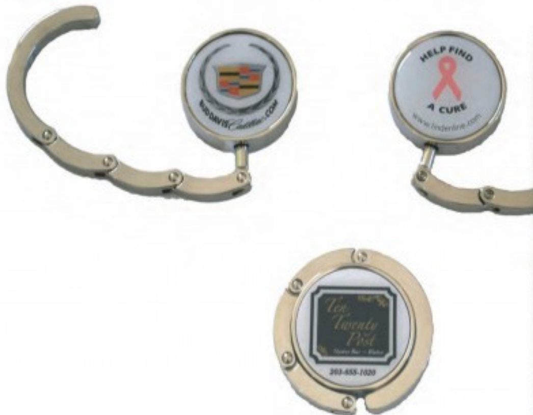
Photo Vision Purse Holder