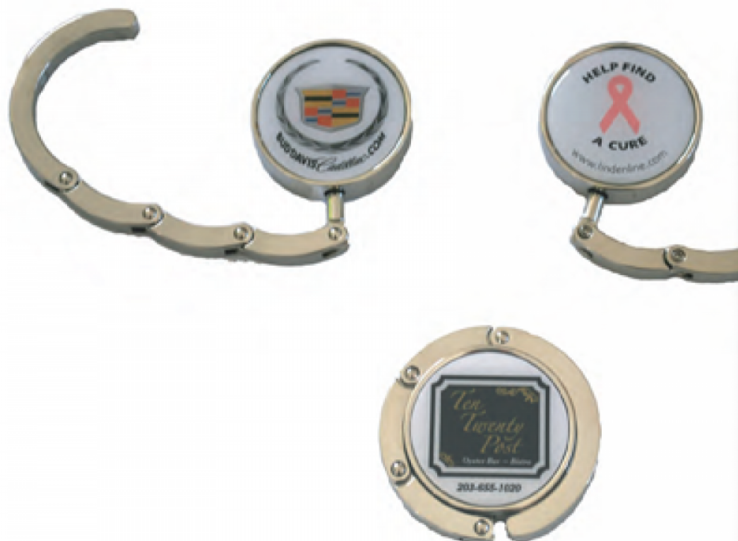
Photo Vision Purse Holder